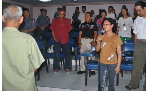
Members of PAR La Union as they were led to sing "Let there be peace on earth"

On May 19, 2011, Peace and Reconciliation (PAR) Community in the Province of La Union was formally organized. Pastors, bishops, and church leaders from the Philippine Council of Evangelical Churches (PCEC) and the National Council of Churches in the Philippines