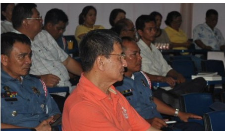
PAR LU Members while actively listening to the other members who were sharing their reflections about peace.