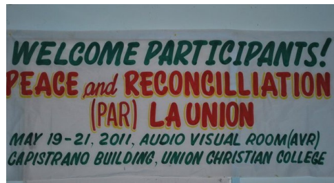
The activity was hosted by Union Christian College, and all their staff were very much supportive and involved in the activities