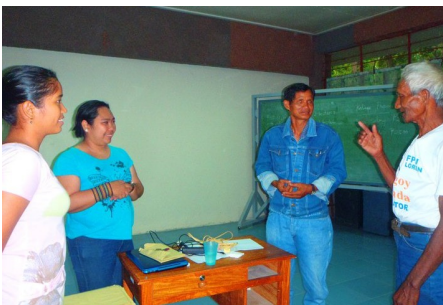
The principal of Asibanglan High School and the eldest participant in the training expressed their gratitude and blessings to PBCI