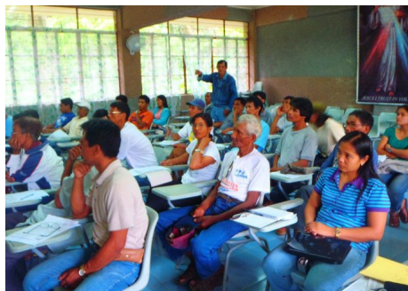
One of the participants translate the discussions in their own native tongue so they could understand it better.