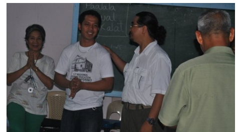
One participant invited a youth leader to join during the meeting. She was very enthusiastic to involve the youth in this ministry