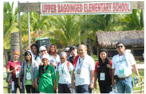
PBCI team with PAR Cotabato members and some community volunteers