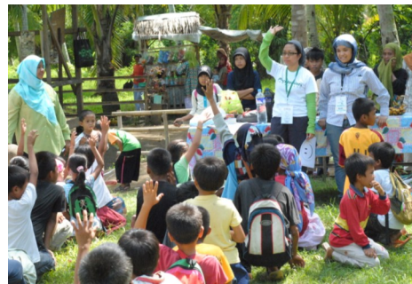
Children in the community enjoying their trauma-healing session