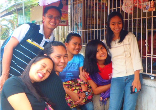
PBCI team and the new field staff during their deployment in the Municipality of Lantapan